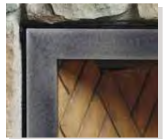
Antique Nickel Plated