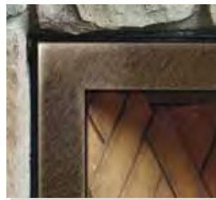
Antique Bronze Plated