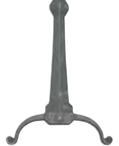
Wrought Iron Andiron