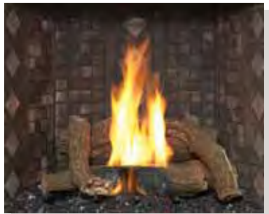
Diamond Mosaic Tile